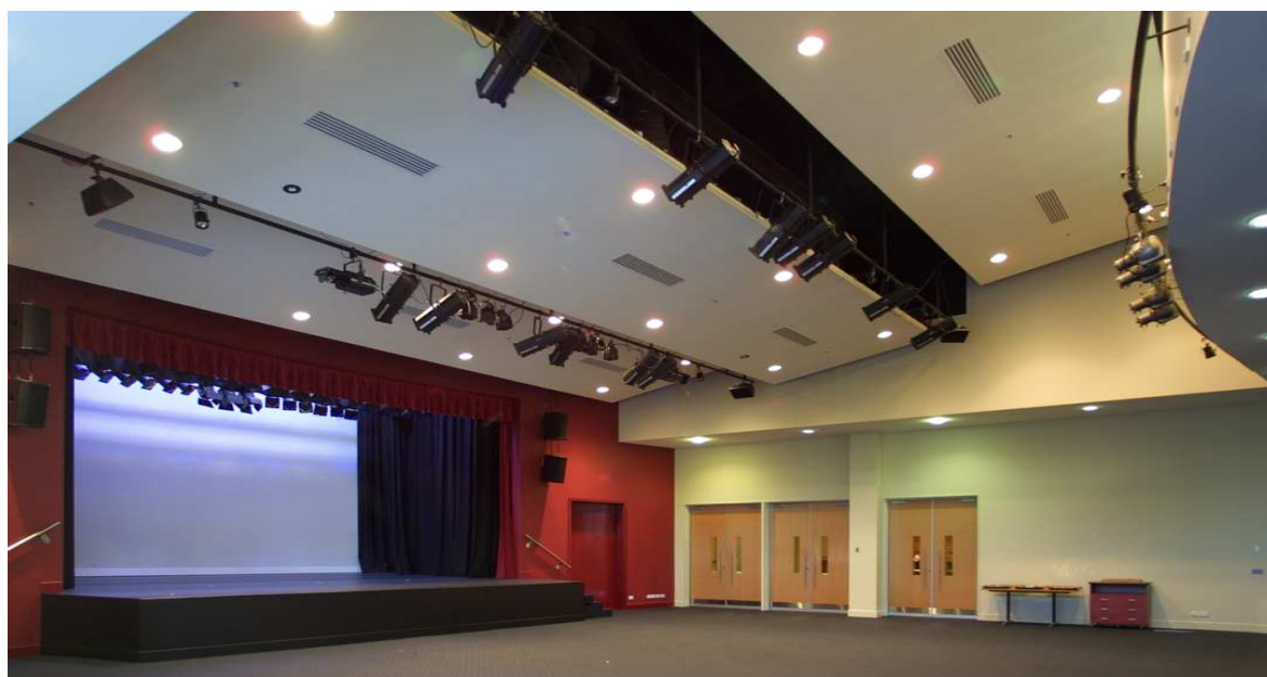
The stage in the Paradise Room at the Gold Coast Arts Centre

The club meets in the Paradise Room of the Gold Coast Arts Centre , 135 Bundall Road, Surfers Paradise. The bar and restaurant open at 6.00p.m. and the music starts at 7.30p.m. until 10.30p.m.. Visitors are welcome. Members of other Australian and jazz clubs world wide are welcome and admitted at members' rates. Website: www.goldcoastjazzclub.com Please reserve your seats at bookings008@goldcoastjazzclub.com or 0405-143-720 . Please do NOT telephone the Gold Coast Arts Centre !