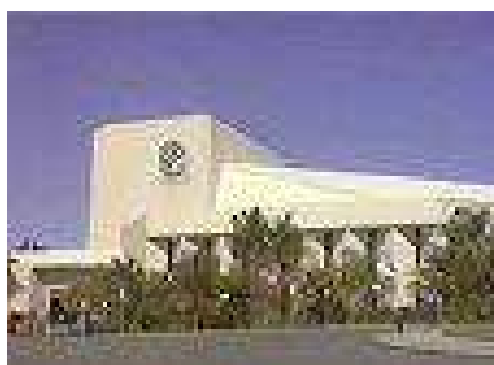
The Gold Coast Arts Centre