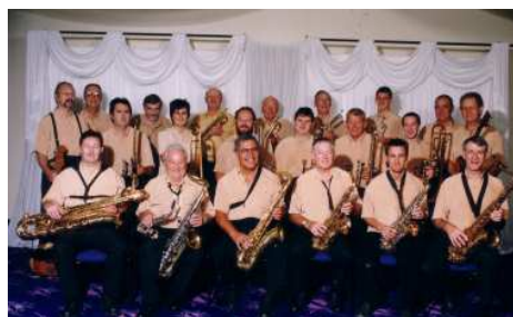
The Summerland Big Band

AUSTRALIA PRINT & COPY "Quick, reliable and friendly service"