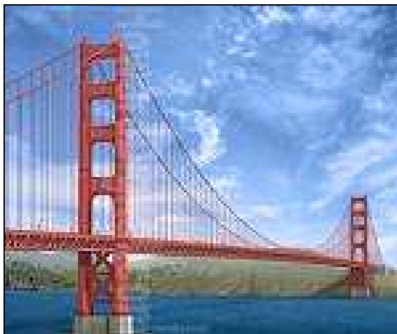
The Golden Gate Bridge, San Francisco